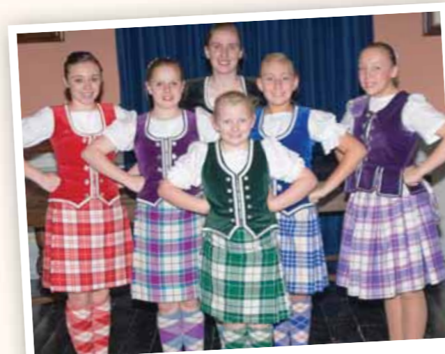
Dancing at Dunbarton Castle

The annual carol service at Upper Largo was well attended and afterwards cheques were presented to Disability Sport Fife for £1500 and the Madeleine Steele Trust for £1000. Fundraising by the revived Glenrothes regional committee resulted in various donations to the Glenrothes Hospital and plans to reconstruct the sensory garden at the hospital.