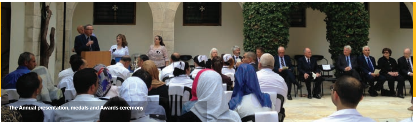
The Annual presentation, medals and Awards ceremony