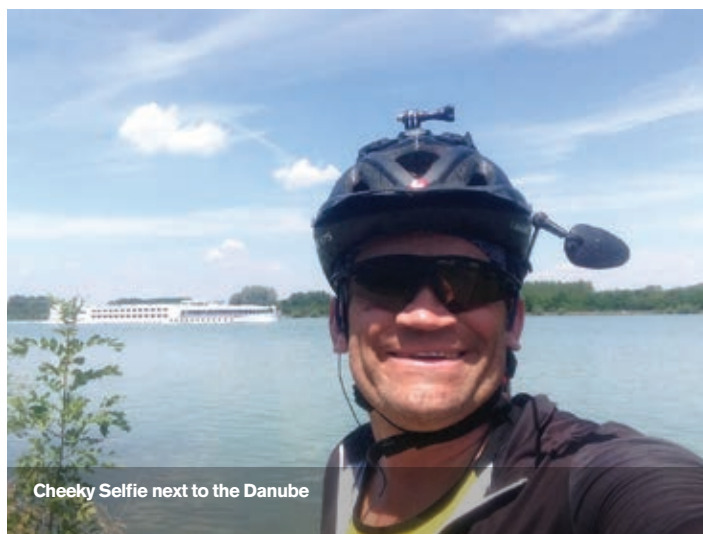
Cheeky Selfie next to the Danube

The grandeur of the former Austro-Hungarian Empire along with the scenery made the ride along the Danube through Serbia, Croatia, Hungary, Slovakia, Austria and into Germany spectacular. The weather was fine with temperatures between 25 and 35°C, and bike and