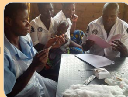
St John Malawi volunteers with a health surveillance assistant