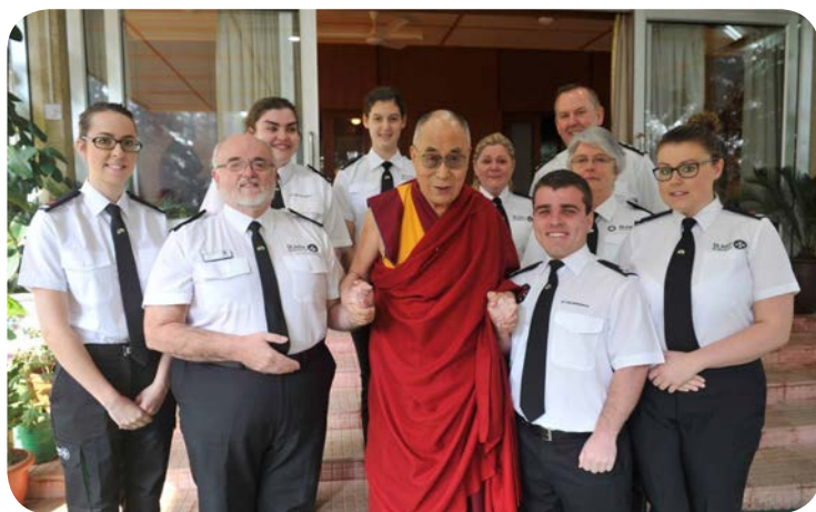
St John Cymru Wales volunteers with the 14th Dalai Lama

St John Cymru Wales volunteers have taught life saving and first aid skills to Tibetan refugees in India for a decade, and have been thanked in person by the Dalai Lama.