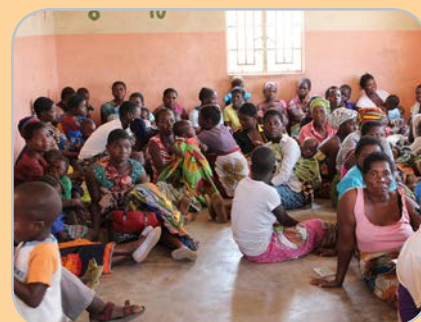
Women and infants in Kauma

http://www.stjohninternational.org/saving-the-lives-of-mothers-and-babies