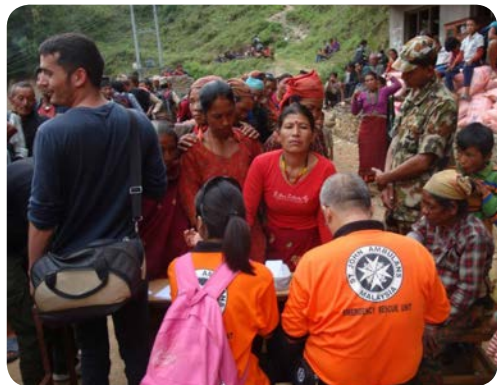
SJAM staff and volunteers in Nepal

On 25 April, a magnitude 7.8 earthquake struck central Nepal and just over two weeks later, on 12 May, a second major earthquake hit the country. Current reports suggest 8,000 people have been killed as a result of the first earthquake, with thousands more injured.