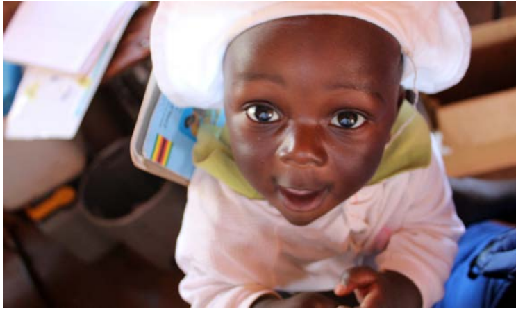
A smiling baby from Zimbabwe

Since October 2015, 99 local volunteers have been trained by St John in Uganda and Zimbabwe to support their communities with the Mother and Baby Programme.