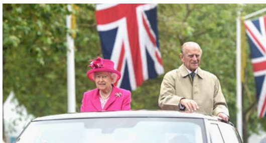
Queen Elizabeth II with Prince Philip greeting the public