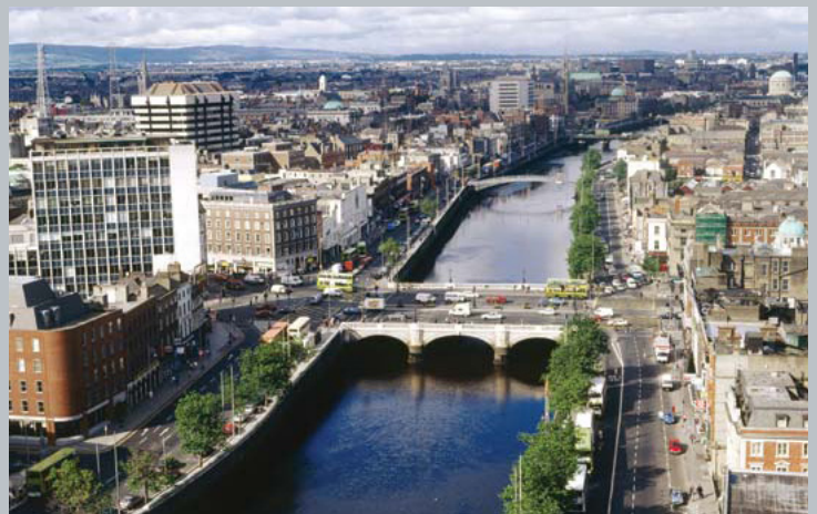
River Liffey flows through the centre of Dublin, Ireland.