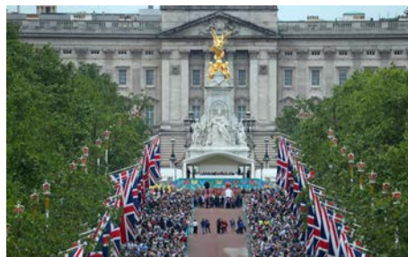
Celebrations at the Mall

Despite the wet weather, over 10,000 guests attended the celebration including individuals from St John International, St John Ambulance from England, St John Scotland, St John of Jerusalem Eye Hospital Group and the Orders of St John Care Trust.