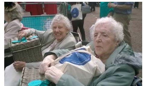
Residents from the Orders of St John Care Trust