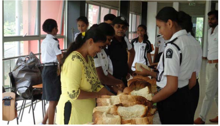
Volunteers distributing food and drinking water for 1,500 people living in Colombo and suburbs.

An estimated 500,000 people have been directly affected with some places experiencing up to 300 mm of rainfall. According to the Disaster Management Centre, 43 people have been killed and close to 307,000 people displaced by the flooding. They are now being