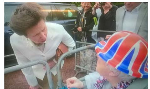
Speaking with Princess Anne