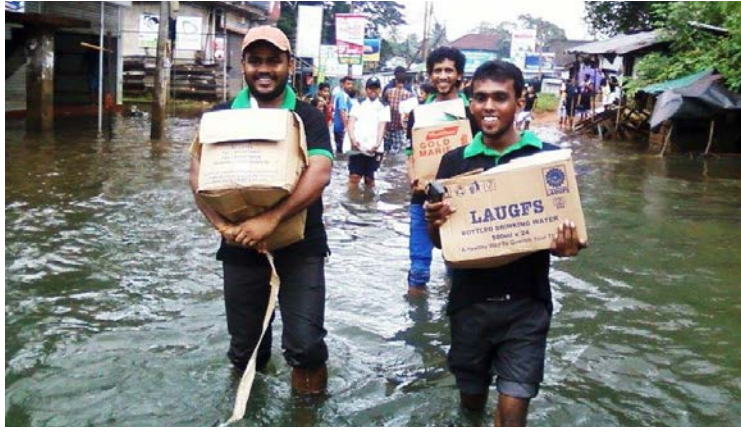
Volunteers from Kelaniya and Delgoda divisions of St John providing relief aid to the communities in Malwana.

Thousands of people in Sri Lanka have been affected by heavy floods and landslides after a deadly cyclone in May.