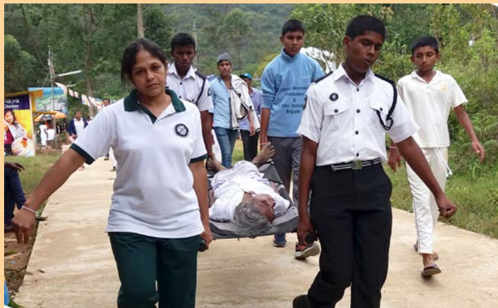
St John Sri Lanka volunteers helping an elderly woman who fell ill during her journey.

During the pilgrimage season to Sri Pada, the Colombo Central Unit of St John Ambulance Sri Lanka set up several first aid and medical camps with the cooperation of teachers from Western Province Education Ministry and nurses from the Colombo National Hospital in late February.