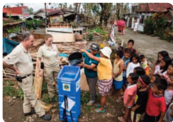
The portable water station is able to produce 1,200 litre of clean water per day.

The affected regions are slowly recovering from the recent disaster,