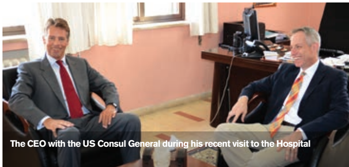
The CEO with the US Consul General during his recent visit to the Hospital

This is significant as our two newly refurbished operating theatres in Jerusalem, along with our new day-case theatre, are now fully functional. The whole process has taken over 6 months – longer than first thought as we had to carry out major roof repairs and replace all the air conditioning along the way – but we should now be able to do so much more for our patients.