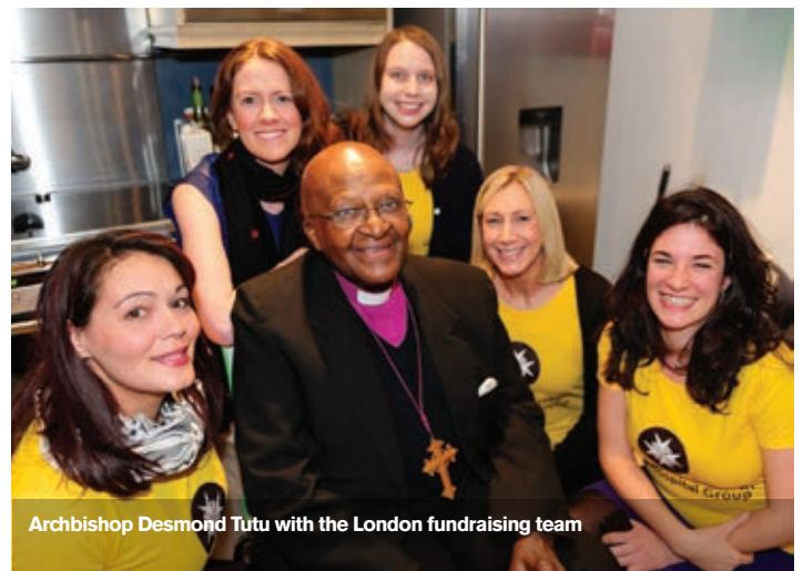
Archbishop Desmond Tutu with the London fundraising team

suffering Palestinian people gain access to healthcare no matter what their circumstances or location. Without this vital institution, many would go without eye care. In treating patients from all backgrounds regardless of their ethnicity, religion or ability to pay, this organisation is a bastion of hope for peace and health across the Middle East."