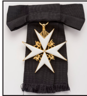
Dame of Justice