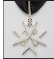
Knight of Grace