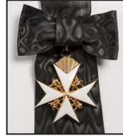
Dame Grand Cross