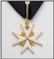
Knight of Justice