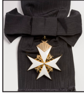
Bailiff Grand Cross

Upon admission into the Order of St John, members are presented with insignia, each level and office being depicted by different emblems and robes for wear at ceremonial occasions. The wearing of insignia, the order of wear when worn with other decorations, and prohibitions on wearing with insignia of certain other organisations, are covered by Order Regulations. Notes on the wearing of insignia are available on request from headquarters.