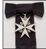
Dame of Grace