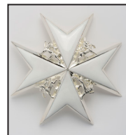
Knight of Grace